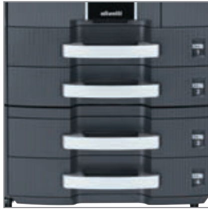
2 ADDITIONAL DRAWERS containing 500 sheets each or a HIGH CAPACITY DRAWER containing 3000 sheets