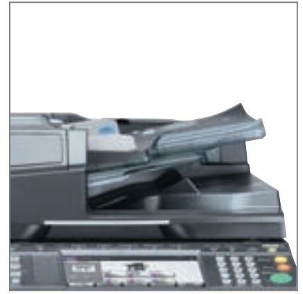
2 TYPES OF DOCUMENTS FEEDERS