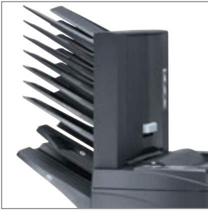
MAILBOX with 7 separate trays