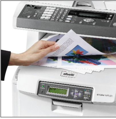
Autocolour Balance and Photo Enhance functions for CONSISTENT COLOUR QUALITY