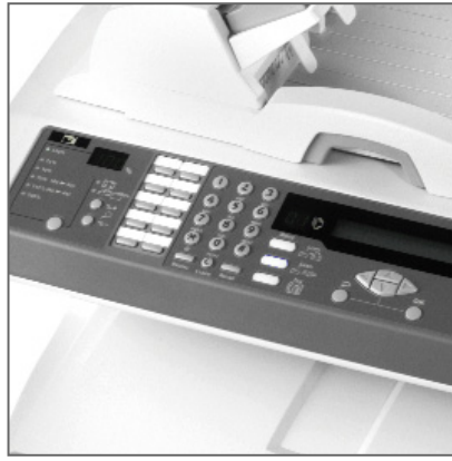
SUPER G3 FAX FUNCTION with separate keys